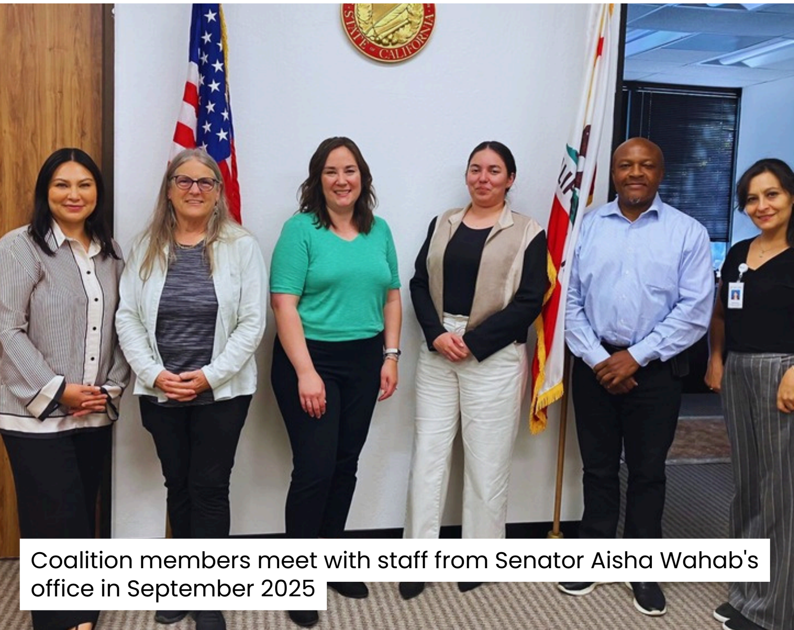
Coalition members meet with staff from Senator Aisha Wahab's office in September 2025